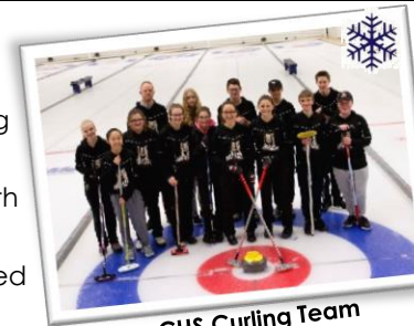
CHS Curling Team