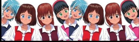
ILLUSTRATION / ANIME CLUB IS ON TUESDAYS AT FIRST FLEX IN THE FASHIONS ROOM. THIS TIME CAN ALSO BE USED FOR THOSE THAT WANT TO WORK ON SEWING PROJECTS OR HALLOWEEN COSTUMES.