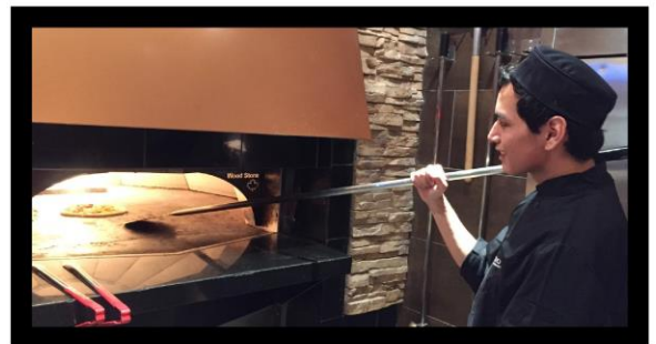
CHEF JOB SHADOW, FIRESTONE RESTAURANT-NOV 2017

"It helped me understand this industry better, and will definitely impact my choice in career. I know more about what to expect if I decide to follow this route."