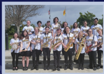
LCI GOLD JAZZ BAND