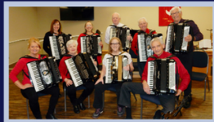
WINDY CITY ACCORDIONS