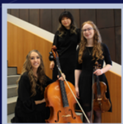
THE CON BRIO TRIO