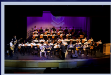
U OF L GUITAR ENSEMBLE CHINOOK GUITAR ENSEMBLE